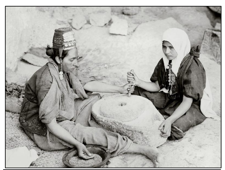
Two women will be grinding at the mill: one will be taken and the other left. (Matthew 24:41)

Time is real, and it disappears quickly. If you are looking for a convenient time to change your life, you are following a fool's errand. Today is the only day you have. It may possibly be the last and final opportunity you have. Make the best of it. Obey God. Serve the Lord. Now.